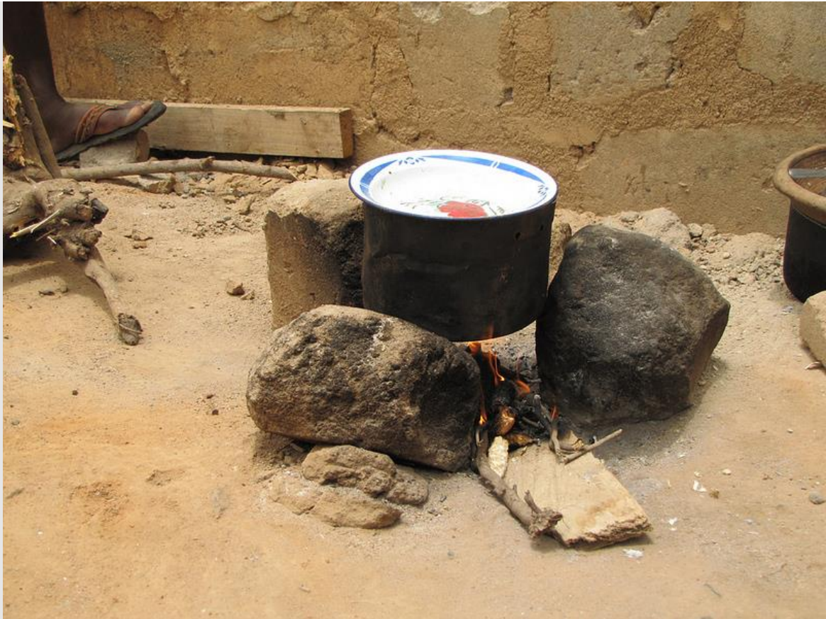
The African traditional “stove”, or Fogão Africano . Remove one rock and the whole thing collapses...

In the absence of any one of these three stones, resource management does not function, just as a cooking pot falls into the fire when a stone is removed. In the case of open-access fisheries (no clearly defined resource ownership), the world-wide dynamic has been resource over-exploitation; it is in the interest of the individual fishermen to catch as many fish as rapidly as possible, before someone else comes and catches them. On the other hand, if no fish are there to be captured (such as in many fisheries worldwide) fishermen also do not manage, but simply go to fish elsewhere. Another example is a field whose fertility has been exhausted. Such fields are abandoned, for they offer no benefit to the farmer. Only when ownership is clearly defined and benefits are realised will people be motivated to manage resources.