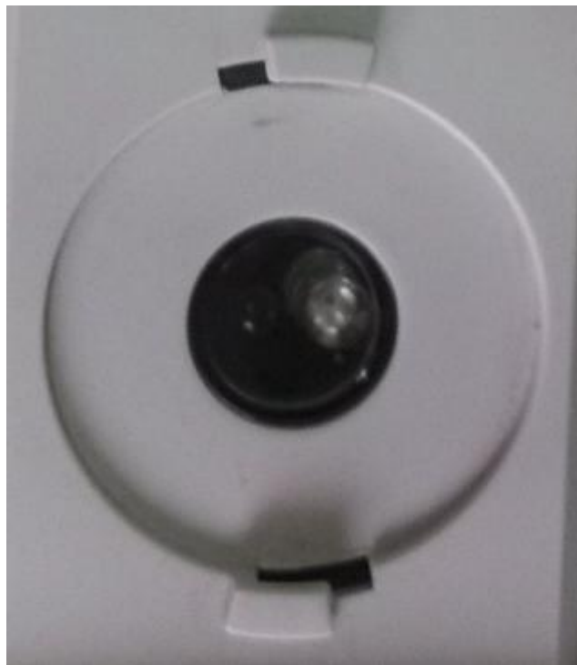
Optical communication port