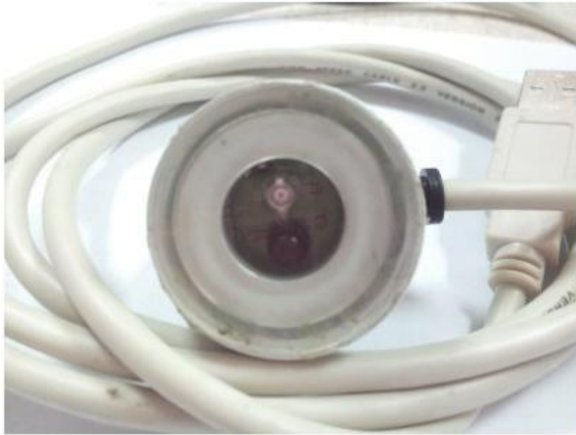
The optical head