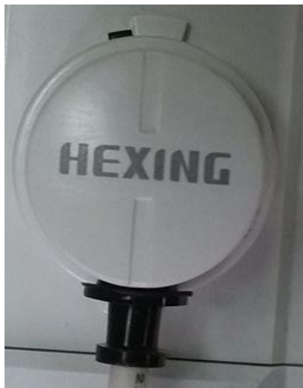
Optical communication port with optical head